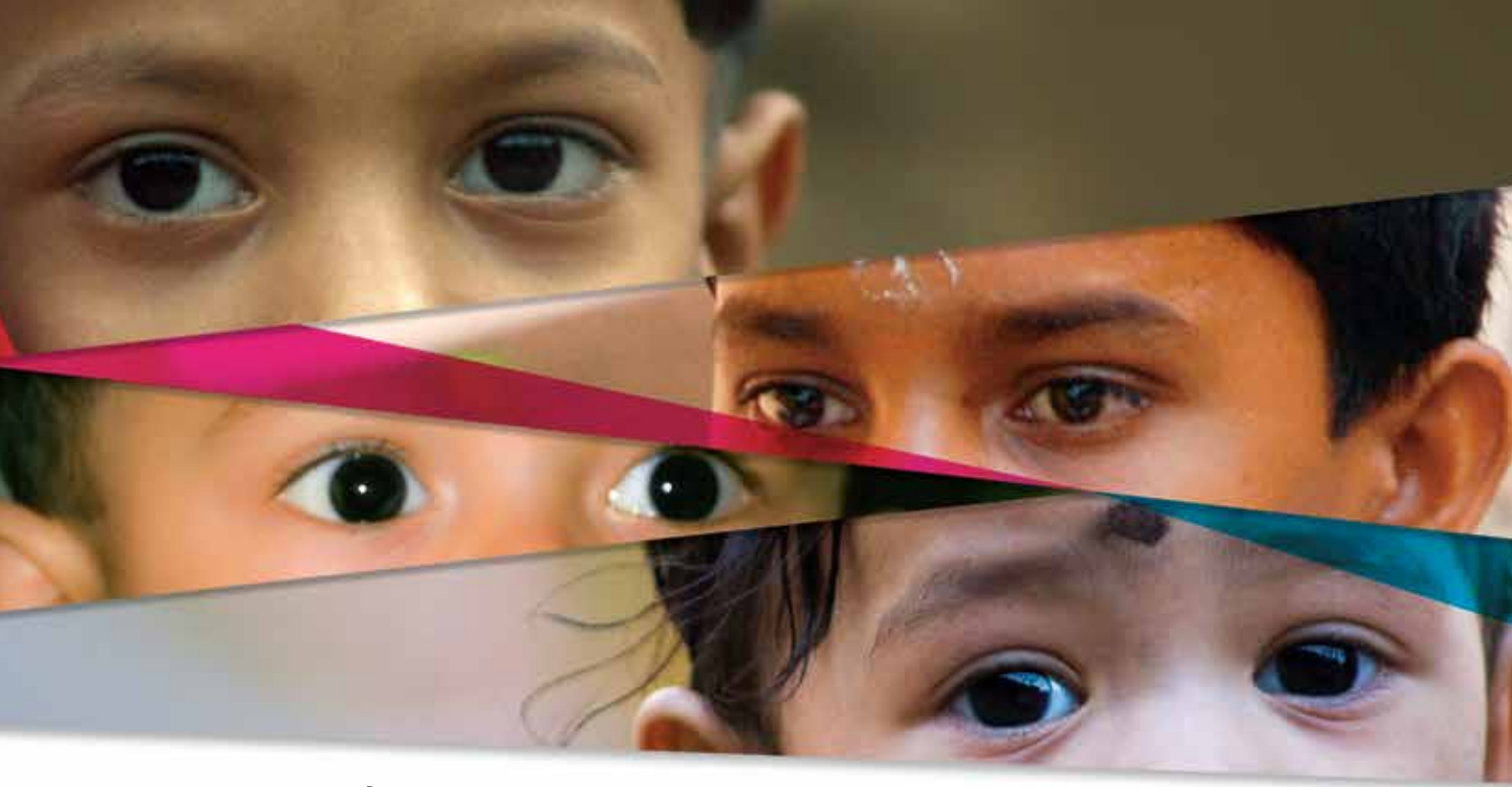
Improving BY Enhancing Capabilities of Child Care Conditions BY Child Care Institutions