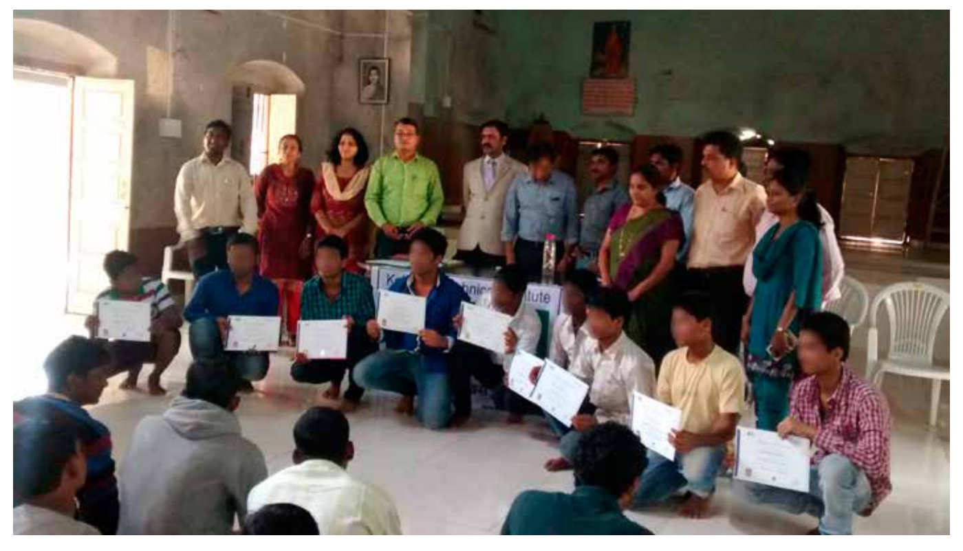
P.S: Faces have been blurred to protect identity of children at the Observation Home in Pune

Two out of ten under privileged children, who underwent training in a two wheeler repairing course have been able to successfully get themselves placed via campus interview. The training program was spread over a 45-day period held at PJNUK (Pandit Jawaharlal Nehru Udyog Kendra) premises by Kohinoor Technical Institute (KTI), Hadapsar, Pune, as boys are not allowed to go outside. The 2 boys placed via campus interview were under 18 when they did the course and had a few months to go. The 10 participants were part of PJNUK located in Yerwada-Pune, an observation and juvenile home for children. CSA thought it prudent that these boys be imparted with some skill development to give them confidence and career option, before they leave the juvenile home. We appreciate the support of District Women and Child development (DWCD) Pune, Juvenile Justice Board (JJB), Resource Cell for Juvenile Justice (RCJJ), Kohinoor Technical Institute (KTI) and Pandit Jawaharlal Nehru Udyog Kendra to ensure success of this activity. Ongoing vocational courses are being conducted with an aim to equip these boys with skill sets that will enable them to take up employment and get rehabilitated back into mainstream society.